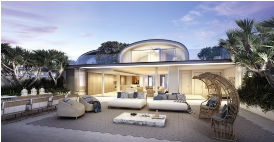
Australia's most expensive apartment is a double-penthouse that sold off the plan for $21 million at The Pacific on Bondi Beach.

Its double penthouse sold for $21 million.