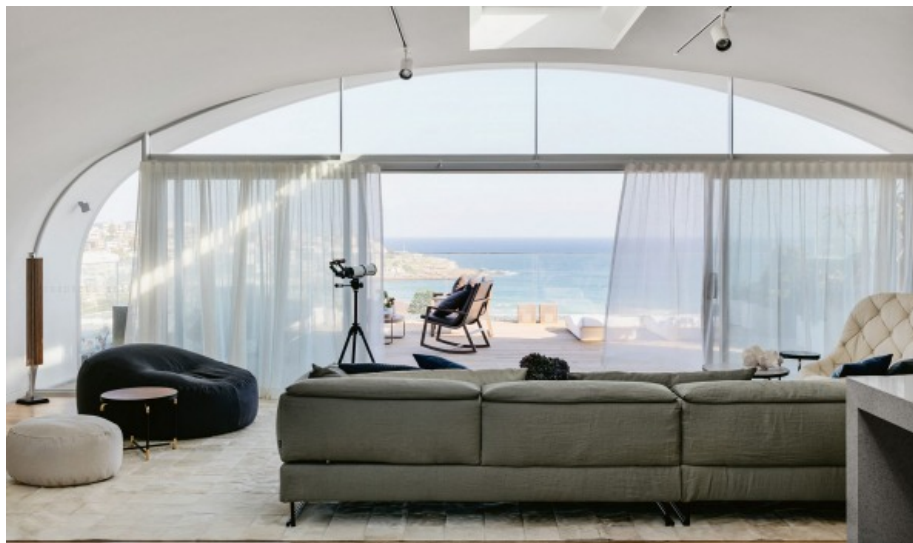
Inside a PACIFIC Bondi Beach apartment.