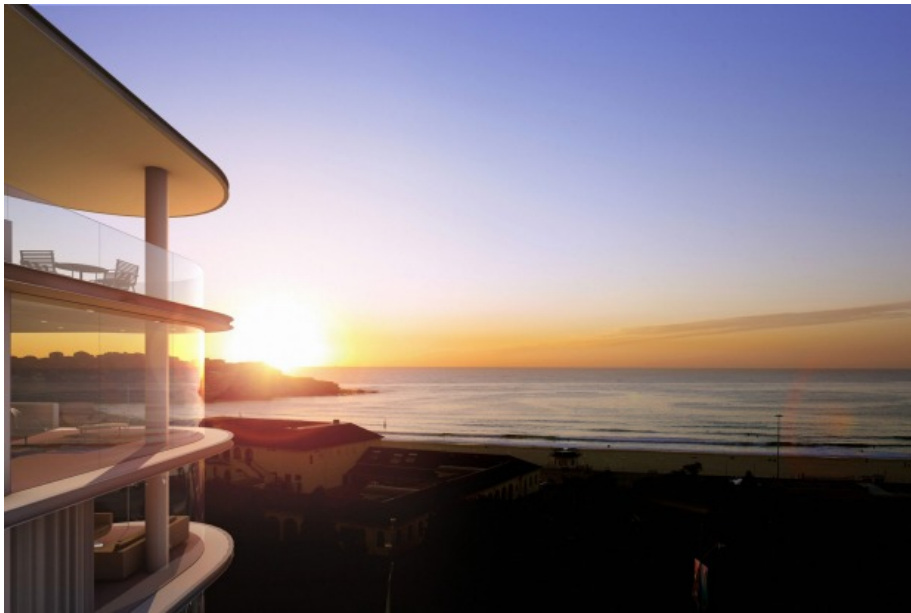
Pacific Bondi Beach views.