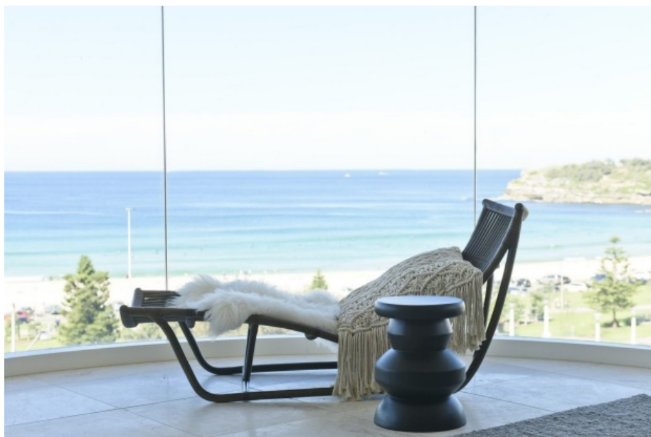
Apartment 406 in The Pacific Bondi Beach.